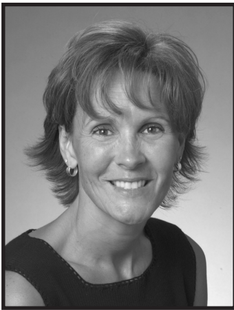
University of St. Thomas Women's Basketball Coach